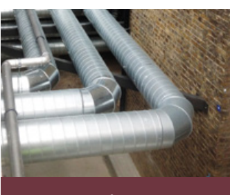
Ductwork, Ventilation and Heat Recovery

Regular service and maintenance on Commercial and Industrial Heating and Air conditioning systems as well as certification is a legal requirement in the UK. We also provide a full service with regards to yearly servicing and reactive maintenance on all types of HVAC equipment.