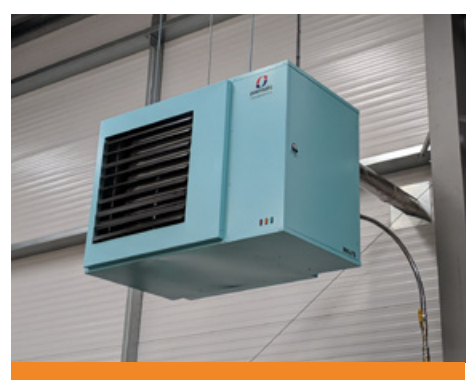
New Warm Air Heaters supplied & installed

Warm Air Heaters offer a cost effective solution to heat many types of industrial and commercial building and are available in both suspended and as floor mounted Air Rotational Heaters. Available in a range of fuels such as Natural Gas, LPG and Oil, CK Services are an approved supplier for all of the major manufacturers.