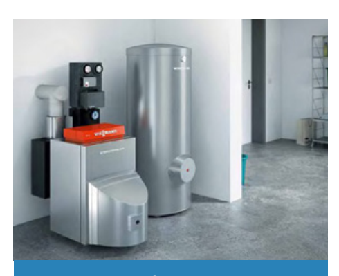
Commercial Boiler Systems

Radiant Tube and Plaque Heaters provide an efficient, space saving heating solution. Ideal for most commercial buildings including garden centres, garages, aircraft hangers and retail showrooms, they can be used to 'spot heat' areas thus saving money on running costs. Available in both Natural Gas and LPG formats.