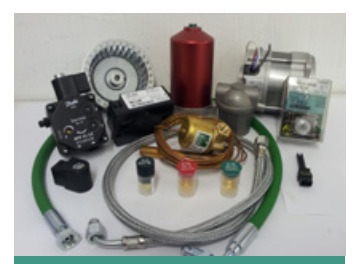
Heating Spares and Ancillary Items

Portable and Marquee heaters are an ideal solution for greenhouses, nurseries and non permanent buildings such as marquee's and building sites for drying building materials as part of a first fix solution. We offer supply, installation and maintenance for all types of portable heaters.